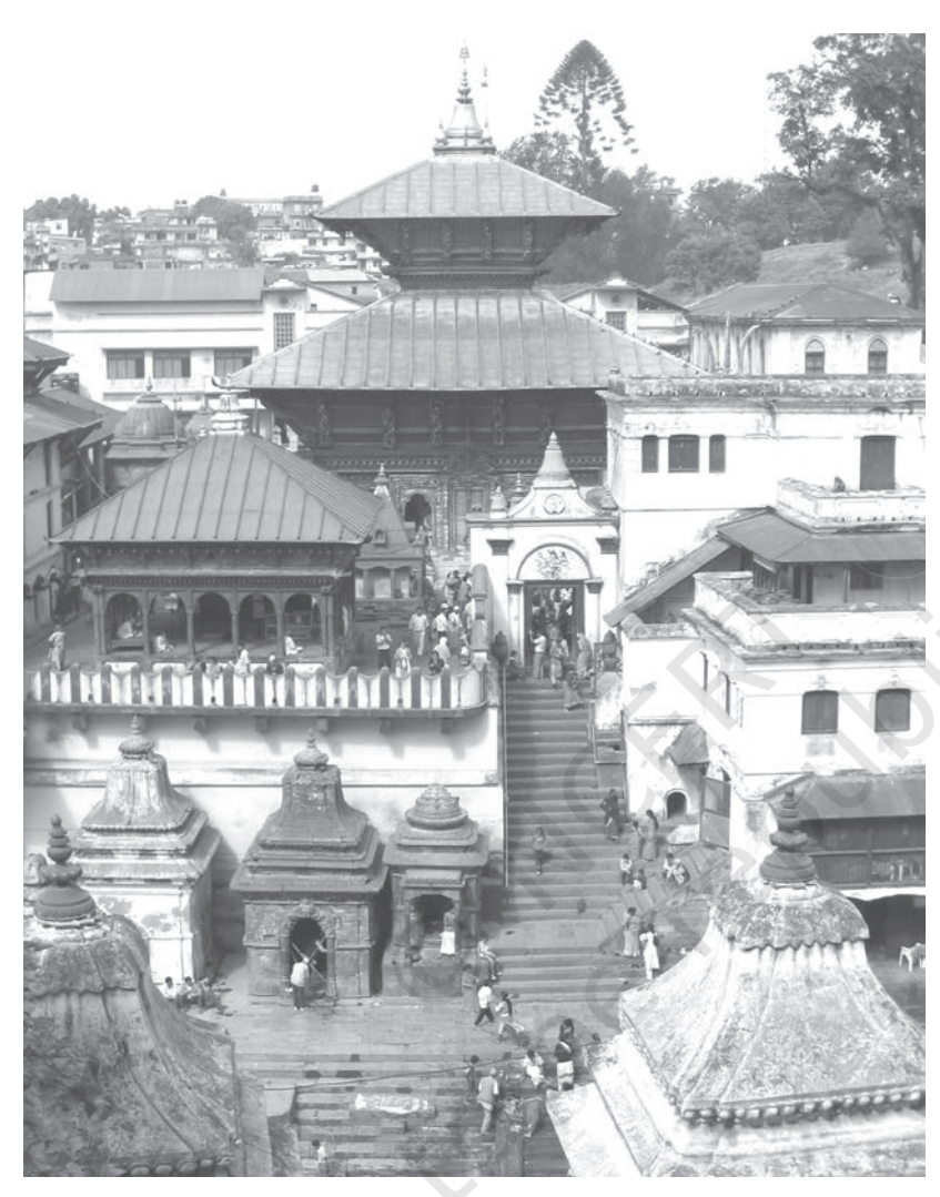
Pashupatinath Temple, Kathmandu

that flows below. A corpse is being cremated on its banks; washerwomen are at their work and children bathe. From a balcony a basket of flowers and leaves, old offerings now wilted, is dropped into the river. A small shrine half protrudes from the stone platform on the river bank. When it emerges fully, the goddess inside will escape, and the evil period of the Kaliyug will end on earth.